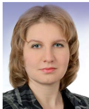
PhD, research worker of Laboratory of Institute of clinical and experimental Lymphology SB RAMS Novosibirsk, Russia, e-mail: gorchak@soramn.ru

Experiment with animals was made on the base of the principles of biological ethics, laboratory practice (GLP), "International recommendation for carrying out of medical and biological studies with animals"