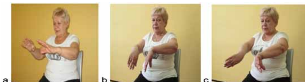
Fig. 2. a – initial position; b, c – steps of exercise