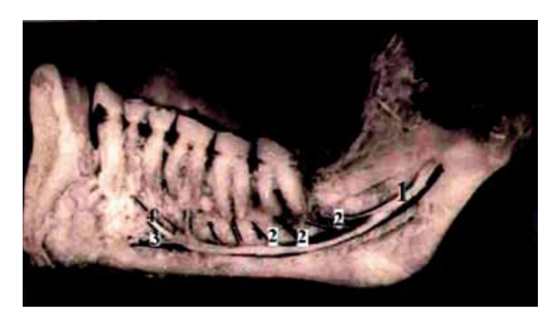
Fig. 1. Inferior alveolar nerve, right. Photograph of the preparation (man 51 years old). 1- inferior alveolar nerve; 2 - the branches to molars; 3 - the incisive nerve; 4 - the branches to premolars

Given the above, the effect of surgical interventions on the mandible directly depends on a detailed knowledge of the anatomical structures located in the mandibular canal (11). The size and length of the canal are related to the degree of development of the body of mandible. This is confirmed by literary data (12). On the studied adult preparations (senile age), features were established in the topography of the inferior alveolar nerve. The main role in changing the topography of the nerve was the safety of the dentition and the morphological condition of the alveolar process. The inferior alveolar nerve, according to macroscopic studies, entered the mandibular canal more often with a single trunk.