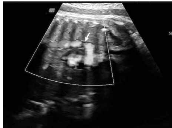
Figure 4. 2-dimensional Power Doppler at 30 weeks gestation. Aortic Arch view. Coarctation of aorta – arrow