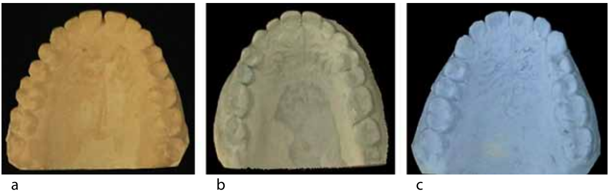
Fig. 2. Photos of plaster models of the upper jaw of patients with normodontia (a), microdontia (b), macrodontia (c).