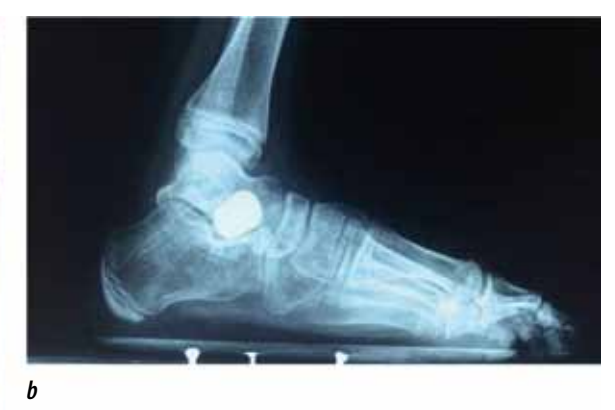
Fig.4. General appearance of foot after operation (a), X-ray examination with implant (b)