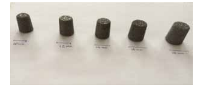
Fig. 1. Set of subtaral porous titanium nickelide implants

In the R&D Institute of Medical Materials and Smart Implants conic porous composite titanium nickelide implants in experimental diameter from 10 mm to 18 mm (fig. 1).