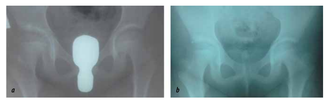
Fig. 2. 3 years after conservative treatment (a), 10 years after conservative treatment (b)

picture, it was decided to start a stage-by-stage conservative treatment.